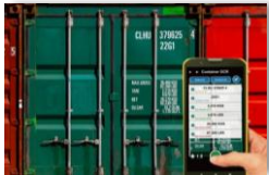
Container Transportation Management