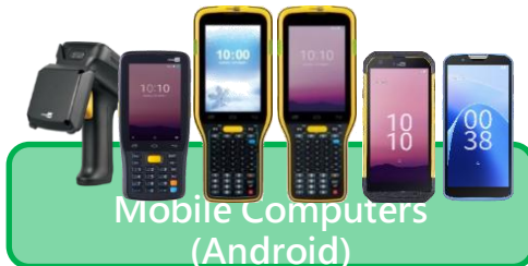
Mobile Computers (Android)