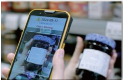
Food Expiration Date Management