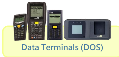
Data Terminals (DOS)