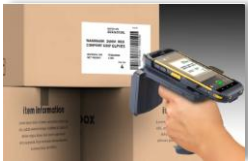
Logistics Document Management