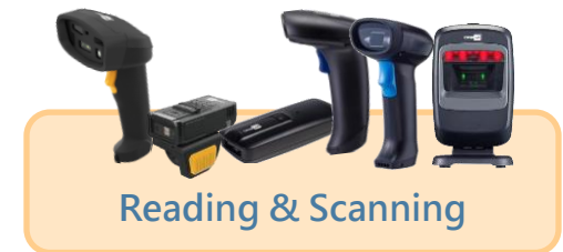
Reading & Scanning