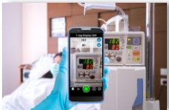
Seven-Segment Number Reading