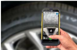
Tire Serial Number Recognition